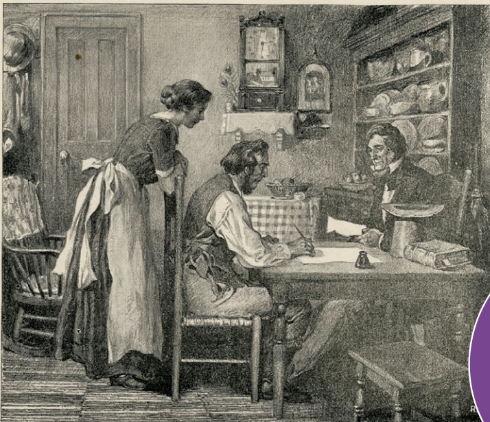
Back in the 1850's, life insurance was limited by law to do little more than offer death benefits.